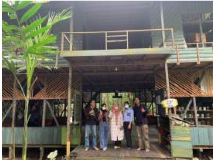
PUPR (Jl. Aris Margono)